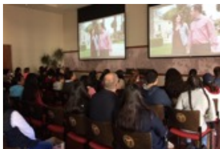
Parents and students learn about Santa Clara University offerings and requirements